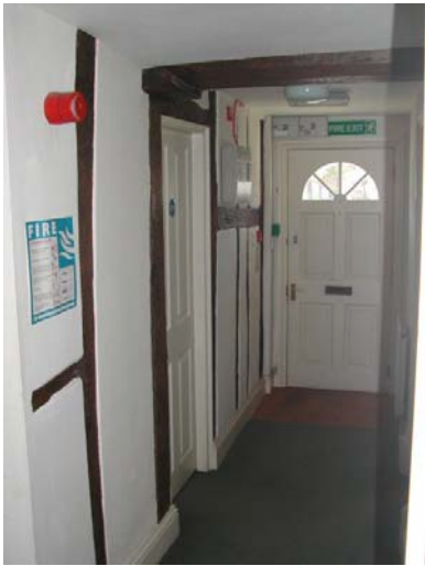
The front entrance hall (left).

Rooms one, two and three have period timbers, period fireplaces and large period windows. The picture (right) shows room two, which has the most rustic of the three fireplaces, the others having period surrounds.