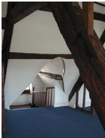
The conference room is decorated and furnished to a high standard.

(9.49 x 4.14m max. measured at chest height).