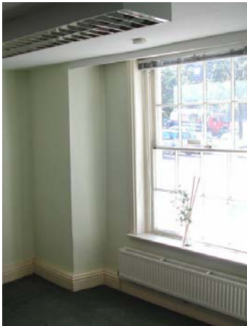
These pictures show office two.

All rooms have large period windows and 'Venetian' blinds.